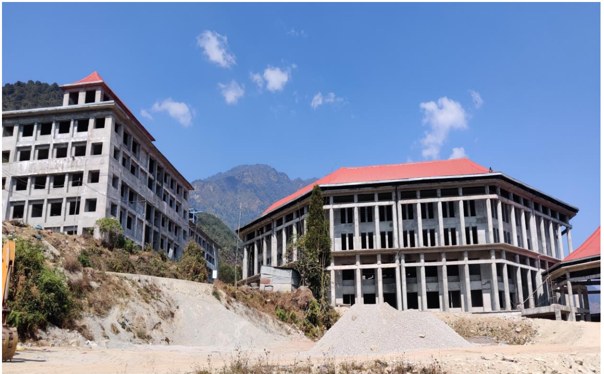
Construction of University Campus at Yangang, South Sikkim under progress.