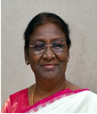
THE VISITOR Mrs. Draupadi Murmu Hon'ble President of India