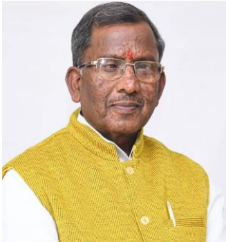
THE CHIEF RECTOR Shri Lakshaman Prashad Acharya Hon'ble Governor of Sikkim