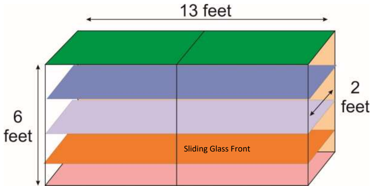
Drawing for sample display unit work